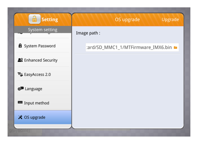
Step 4. Tap [Upgrade] in the upper-right corner of the dialog box to start OS upgrade.