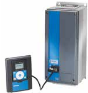
Keypad door mounting kit