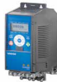
Option board mounting kit