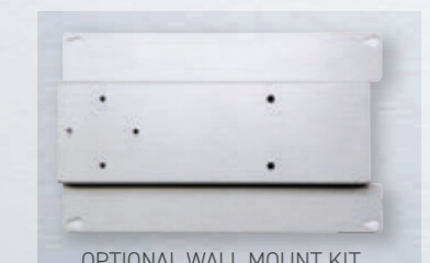
OPTIONAL WALL MOUNT KIT

4 line LCD character KEYPAD to rotate in 90° steps