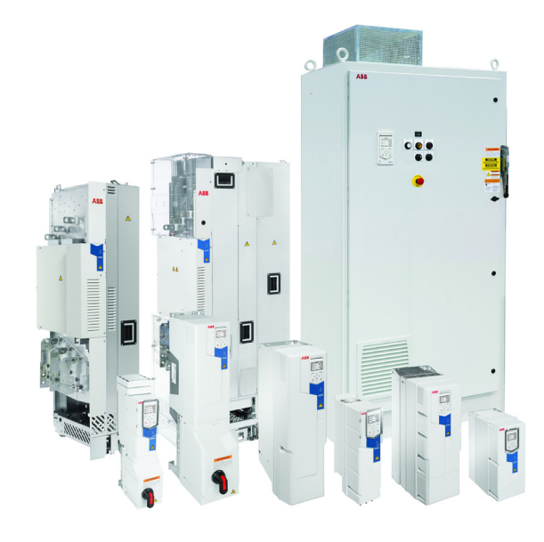
ABB Inc Drives 16250 W. Glendale Drive New Berlin, WI 53151

We reserve the right to make technical changes or modify the contents of this document without prior notice. With regard to purchase orders, the agreed particulars shall prevail. ABB AG does not accept any responsibility whatsoever for potential errors or possible lack of information in this document.